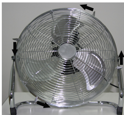
5. Close the 4 hooks as shown by the arrows.