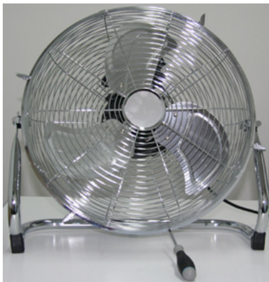
2. Unscrew the lower screw by a screwdriver.