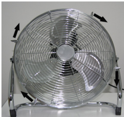
1. Open the 4 hooks as shown by the arrows.

Clean the fan inside frequently, based on the environmental conditions: a dirty fan may prevent the fan from working properly.