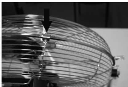
4. Refit the grid onto the fan by fixing firmly the upper hook to the bars of the grid as shown by the arrow.