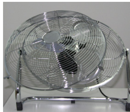
3. Remove the front grid and clean by a vacuum cleaner.